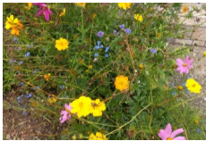
OUR DESTINIES LIE IN THE STORIES WE TELL

Many healing practitioners and communities use storytelling as a way of getting at the deeper sources of someone's condition or situation. Storytelling can often have a therapeutic effect on both the audience and the storyteller.